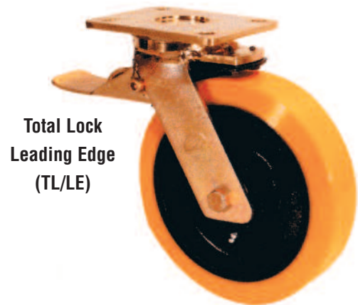
Total Lock Leading Edge (TL/LE)