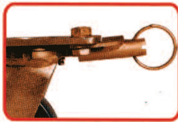
Directional Lock (DL)